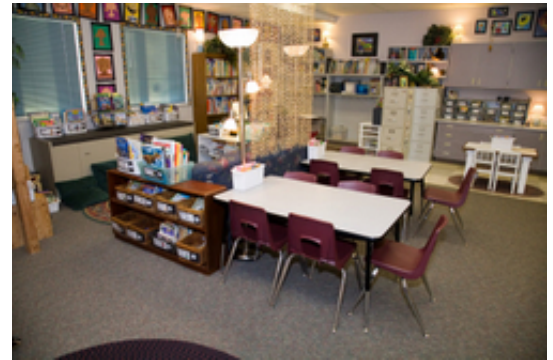
Trying to create the feel of "rooms" within a larger space of a classroom is a snap wit a screen. Here a bamboo screen separates the classroom "den" (library), giving the area a cozy feel while still allowing us to see through the "wall" to keep track of what children are doing.

© 2006-2011 ChoiceLiteracy.com All Rights Reserved. Reproduction without permission prohibited.